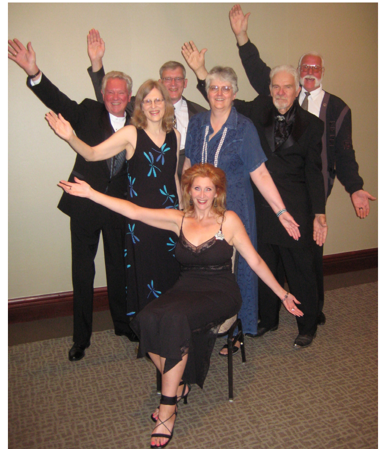
Beanstalks at the 2008 Convention in California