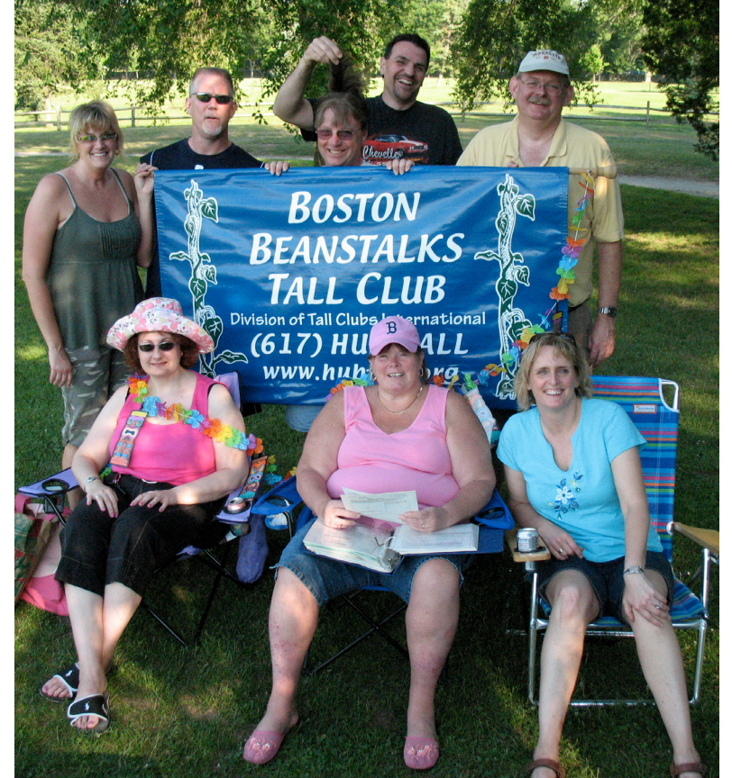
The Beanstalks Picnicked in Rhode Island