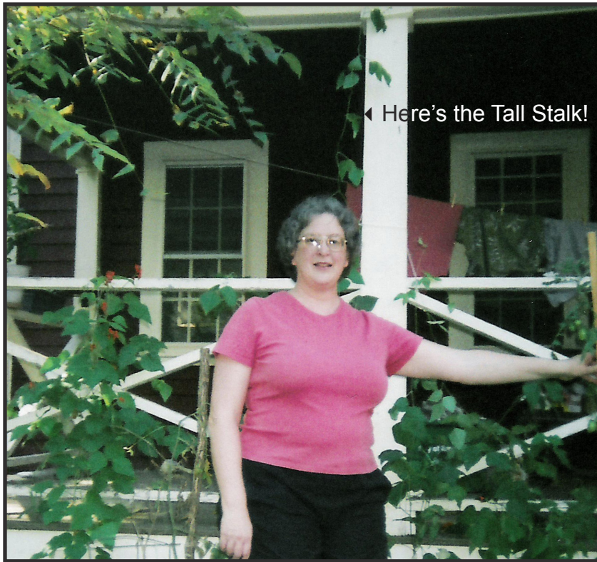
◀ Here's the Tall Stalk!

Our Social Director shown here with beanstalks she grew, with one very tall one directly behind her!