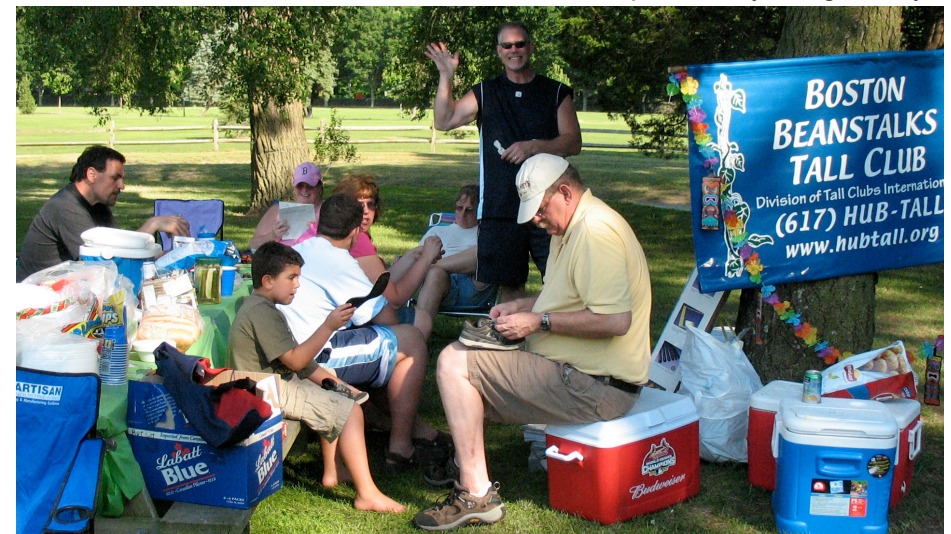
... and we had lots of good food and fun! Thanks for coming!