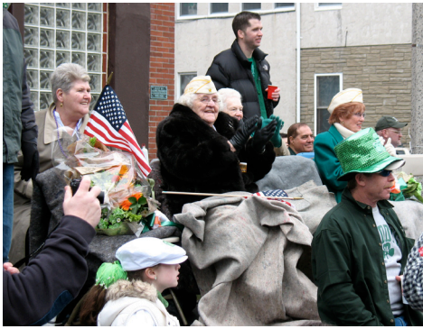
The Grandstand loved us!