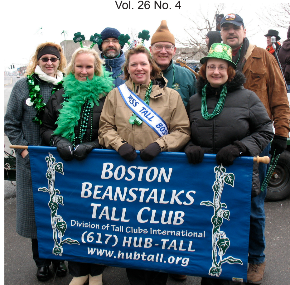
Frozen Beans at the St. Paddy's Parade