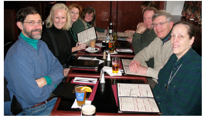
We unwound at the Fowler House afterward.