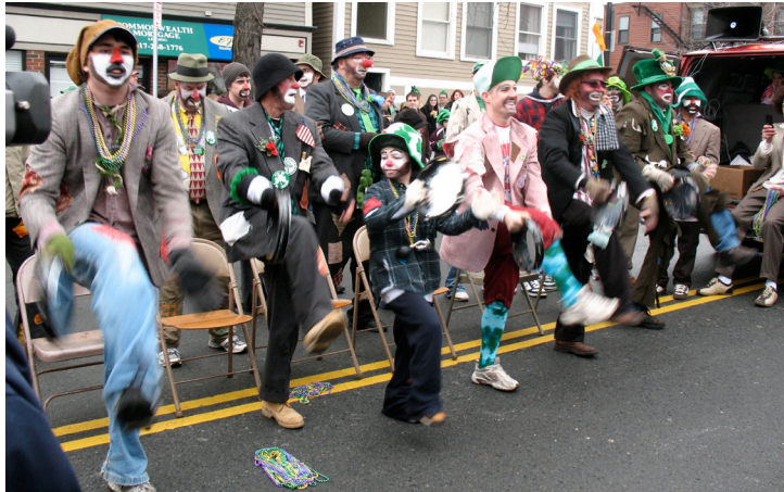
We were preceded by these clowns and they would stop and dance...