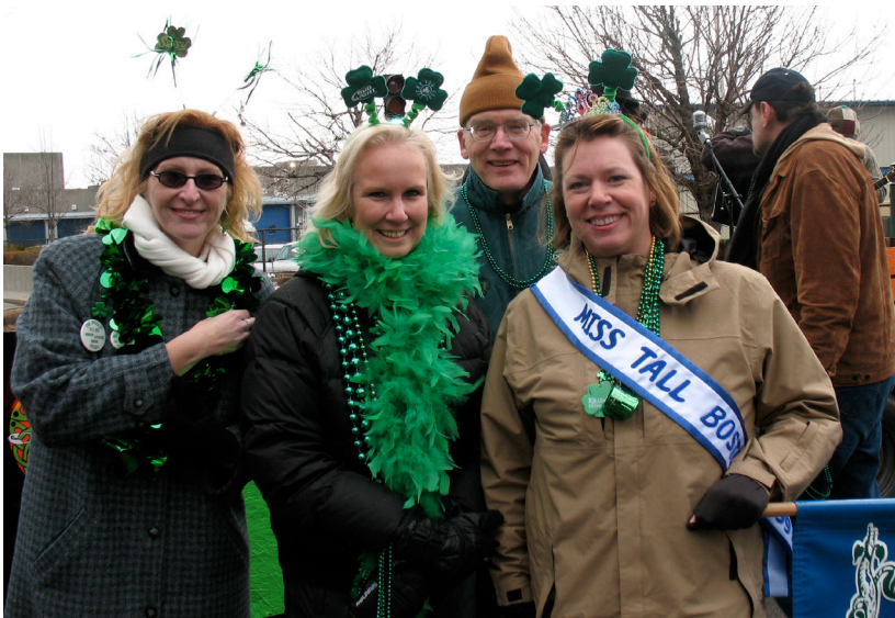
THE BEAN POD