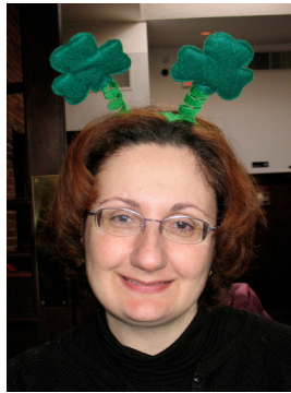
Elaine grew shamrocks...