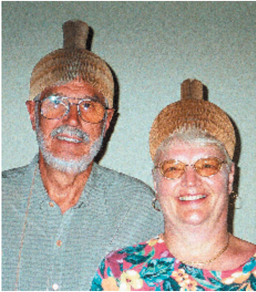
An unplanned couples costume: Acorn Caps from different states!