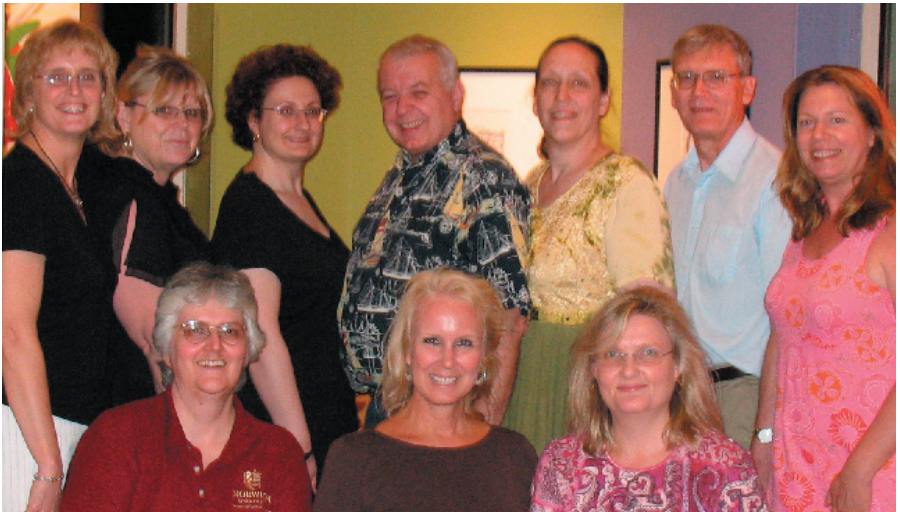
In Attendance at Our Previous Business Meeting

MBTA: Take the D train of the Green Line to Newton Highlands. Walk up to Walnut Street and cross to the corner of Walnut and Lincon Streets. There is a bus stop there for the #59 bus to Needham.